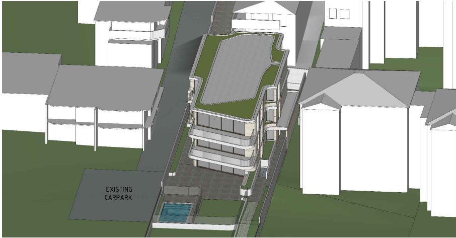
1 JUNE 21ST - 9AM