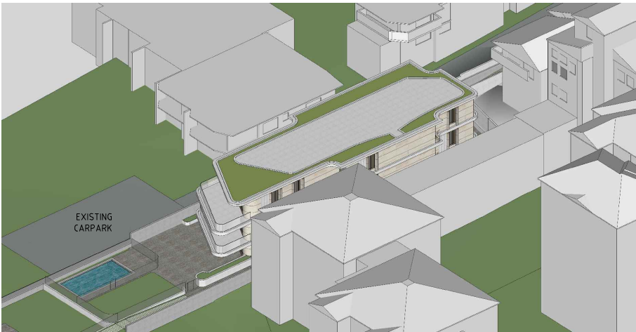
5 JUNE 21ST - 12PM