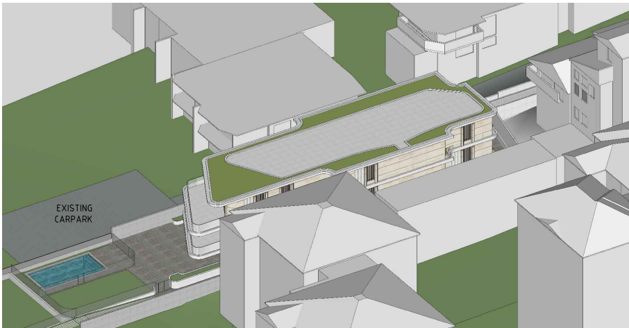
6 JUNE 21ST - 12:30PM