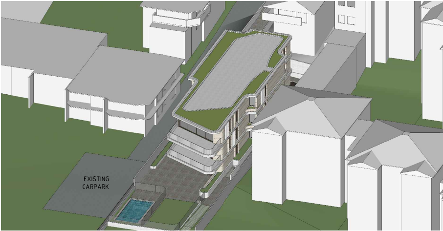
2 JUNE 21ST - 10AM