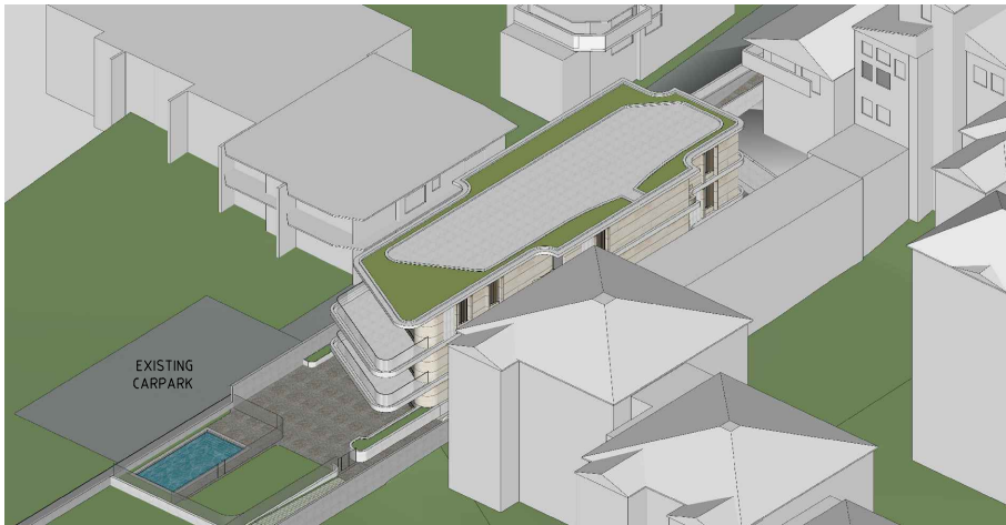
4 JUNE 21ST - 11:30AM