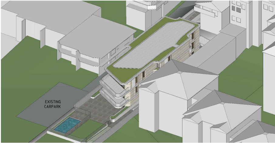
3 JUNE 21ST - 11AM