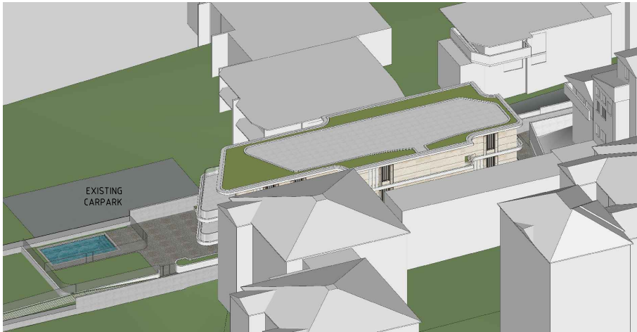
7 JUNE 21ST - 1PM